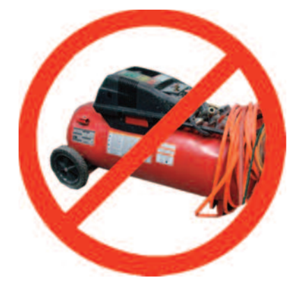
Air compressors that are designed for other uses like tire inflation (usually around 50 PSI) can easily harm your Sea Eagle which has a much lower working pressure. It's for this reason we recommend only using Sea Eagle electric pumps.

The portable battery is optional, if you ordered it, connect the battery to the quick connector on the pump.