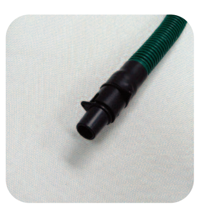
The hand pump comes with a second hose that has a smooth valve adapter attached at one end. Use this adapter to inflate your DKS.

Insert the pump hose with the recessed valve adapter into the valve and turn clockwise to lock into place and then beging pumping.