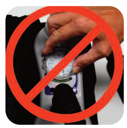
ATTENTION: Never turn the dial when the device is under pressure as this will immediately cause the instrument to break.

Included are a cluster of adapters, with raised numbers on each arm of the cluster. The adapter marked #1 is the only adapter needed to inflate your Sea Eagle.