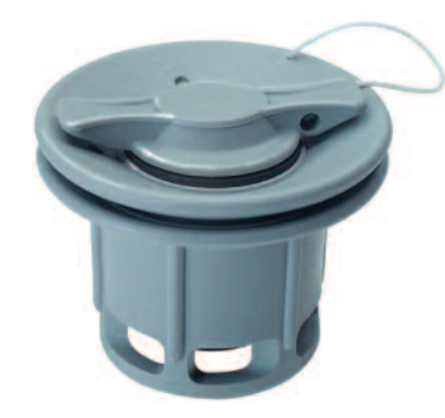
Recessed Air Valves A recessed one-way air valve is featured on the Sea Eagle LongBoard for inflating your SUP.