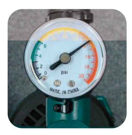
With the pressure gauge in place you can now attach the hose.